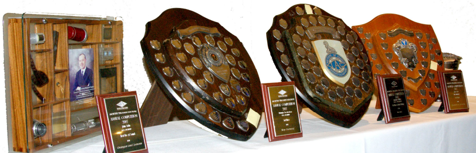
The North Thames Trophies

The AGM will take place at 2.15pm Papers for the AGM are on pages 7, 8 and 9 and can be pulled out.